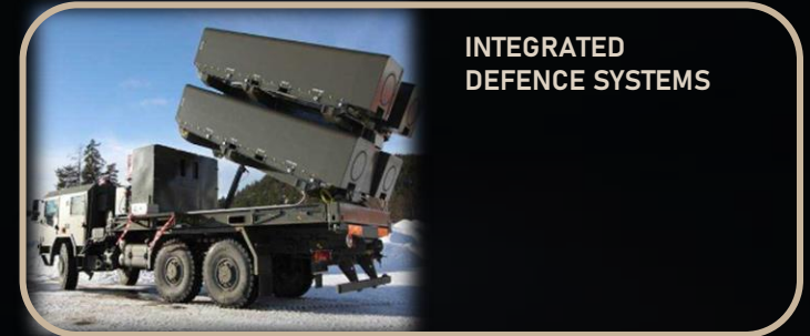
INTEGRATED DEFENCE SYSTEMS