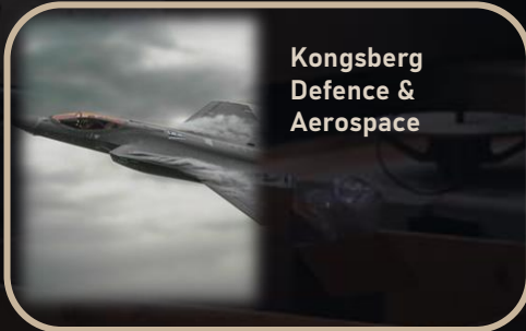
Kongsberg Defence & Aerospace