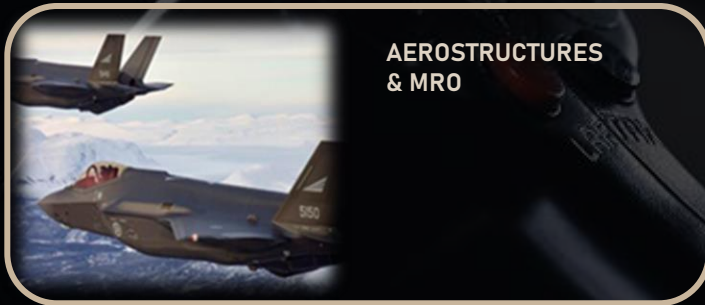
AEROSTRUCTURES & MRO