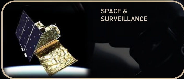
SPACE & SURVEILLANCE